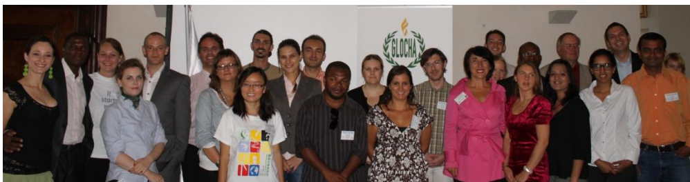
IAAI members at IAAI General Assembly September 15 2011 in Klagenfurt am Wörthersee/Austria

IAAI main objective is to explore and promote systemic innovation regarding resource mobilization of global civil society for effective global governance in support of the work of United Nation System. IAAI is a United Nations Department for Public Information (UN DPI) associated NGO and member of United Nations Academic Impact Initiative. Since IAAI General Assembly 2011 global youth representatives constitute the majority of IAAI membership and Rio+20 Global Youth Music Contest is the most important IAAI flagship initiative www.glocha.info/index.php/glocha-initiatives/gcsw .