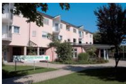
Youth hostel Jugendgästehaus Neckheimgasse 6, Klagenfurt http://www.oejhv.at/index.php?id=61&L=1 (15 minutes walk to Maria Loretto palace)